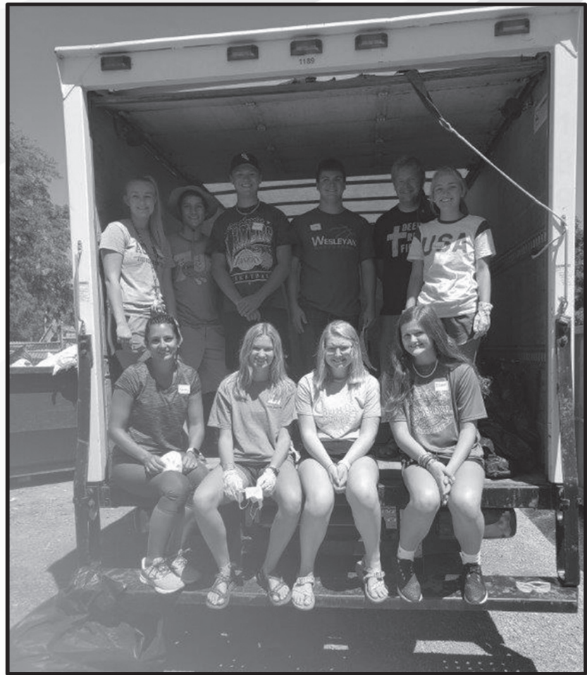
A wonderful group from Corsica Dakota Christian School helped us out in the Thrift Store. They accomplished a lot!